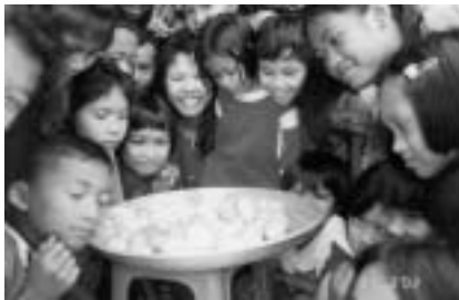
An Annual Sunday School Kit to Help Children Foster a Sense of Stewardship and Mission