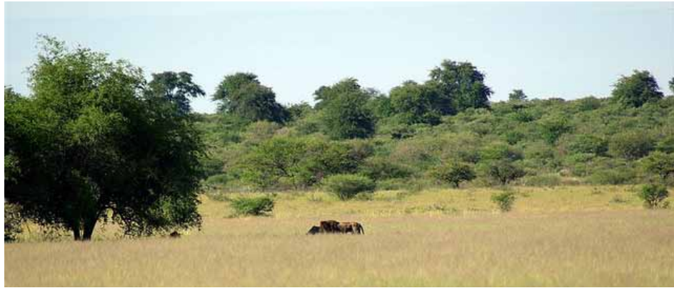
The Central Kalahari Game Reserve, where the G/wi will soon have wells for water.

Meanwhile, in order to gain water for their communities, the San people filed another law suit to override government refusal to permit borehole reopening. The suit was turned down by a single judge from the High Court in July 2010. However, in January 2011 a further appeal received a unanimous response from the the court stating that; the government did not have the right to prevent people from drilling for water, or from reopening old boreholes. It was up to the G/wi, and the other San, to move forward from there.