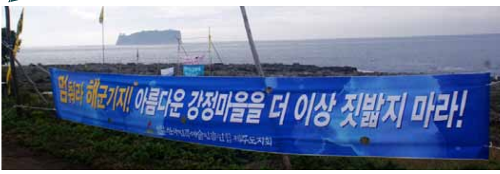
Photo cutline: A banner on the shore JeJu Island reads, "Stop the Naval weapons base! No more relocation [of the base] to the beautiful village of Gangjeong!" – photo provided

The naval base is being "forcefully" constructed near Gangjeong village, a gathering of perhaps 1500 farmers and fishers, say activists. As a strategic military location in close proximity to Korea, mainland China and Japan, the island has for centuries endured colonization and conflict.