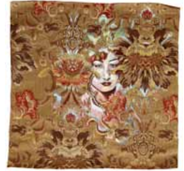
Detail, I will become that blue bird

The work in this show spans more than 25 years. The large painting, "Icons of Argentina," completed during the thesis year of my BFA Honours at the University of Manitoba, dealt with particular events of human rights abuses perpetrated by the military government in my native Argentina right after I had emigrated to Canada. Distance allowed me to research the subject with a degree of detachment, yet as I look back it also synthesized my own emotions as an outsider to the new culture.