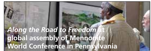
Along the Road to Freedom at global assembly of Mennonite World Conference in Pennsylvania