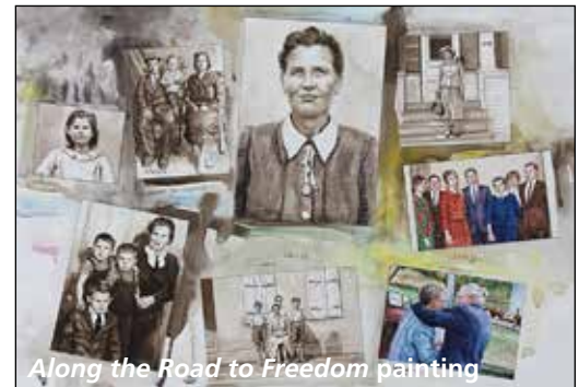
Along the Road to Freedom painting