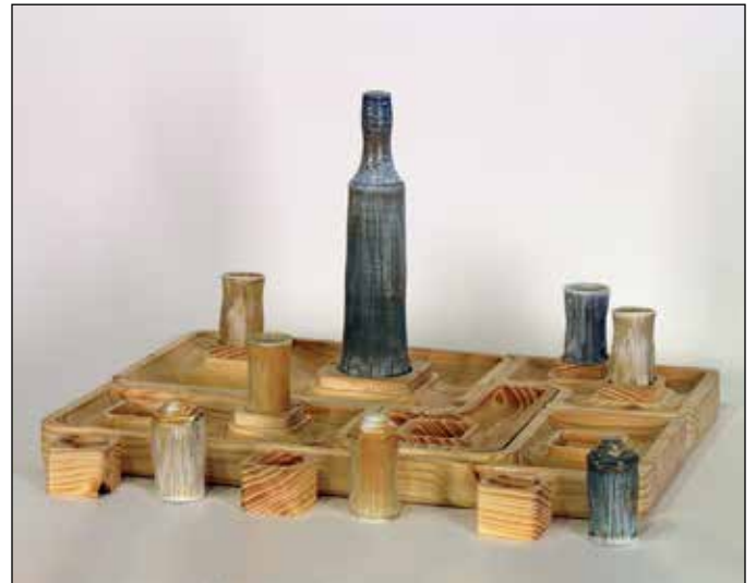
Terry Hildebrand, Bottle with Cups, 2014

Canvas — a piece of strong cloth on which to paint a picture