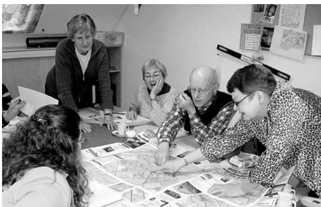
Developing a missional curriculum for Dutch congregations

As staff workers, we found it useful and inspiring to invite the critique of “outsiders,” many of whom did not share our particular confessional background. However, opening oneself up for critique like this is not for the faint of heart! Taking an honest look at where you have been and where you are going can be painful, as you may be confronted with unexamined assumptions or asked to let go of programs or ideas you have held onto for largely sentimental reasons. The results, however, can revitalize your ministry.