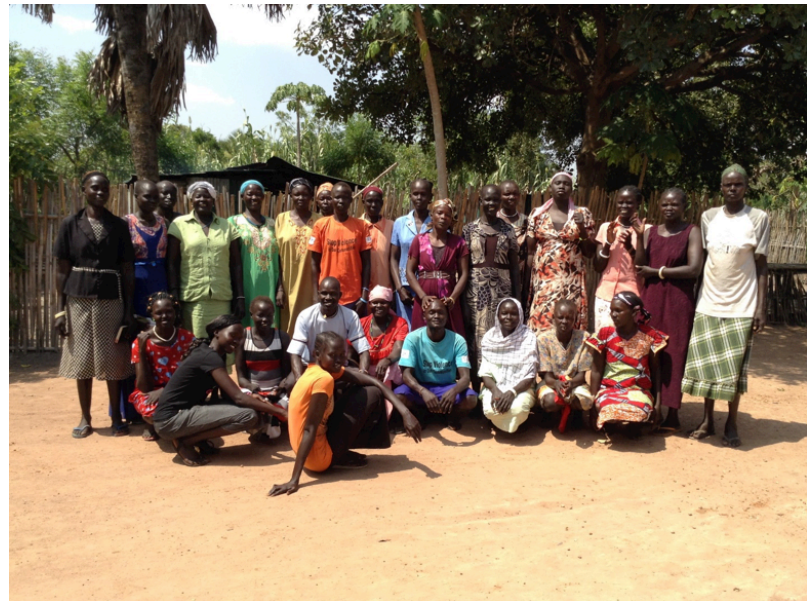
Primary school children enjoying a school meal in Rumbek, South Sudan.