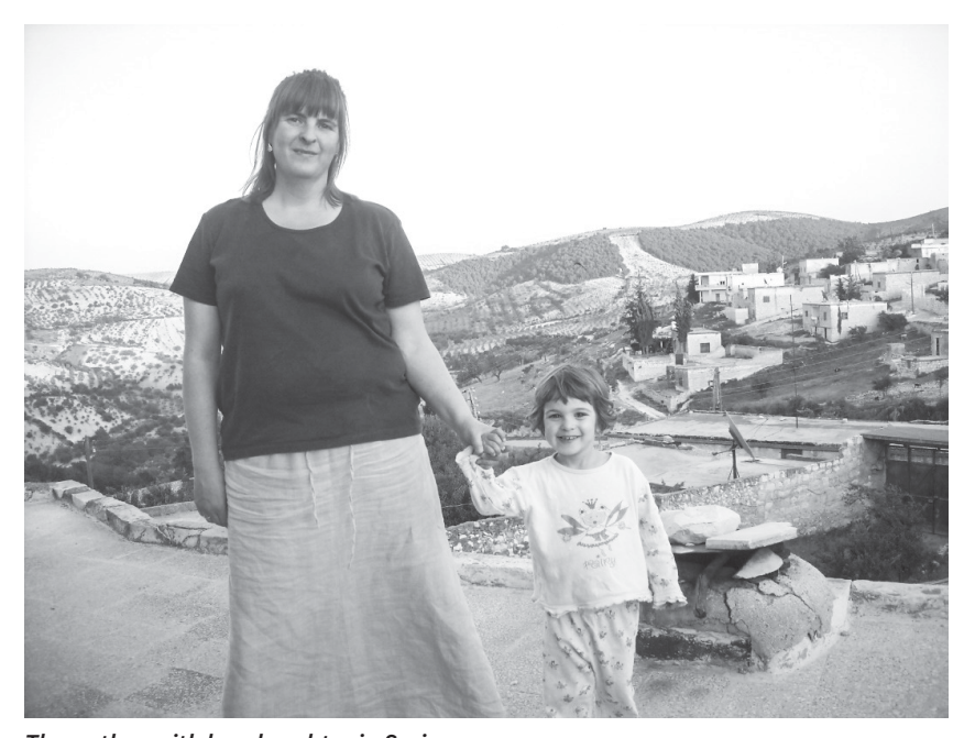
The author with her daughter in Syria.

ish people are very sociable; they respect all human beings in fellowship, live in close harmony with nature, and have a great love of nature. In this little village in Syrian Kurdistan, people used to grow olive trees, harvesting the olives and pressing them into olive oil. They also grew fruit trees, tended sheep and goats, and had some land for wheat and lentils and so on. Every household had a big kitchen garden.