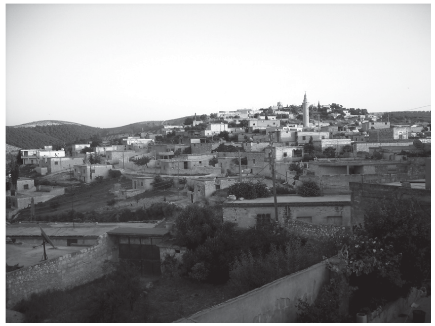
The village of Kaxere.

In the world outside the churches, we speak in more secular terms of addressing social and environmental issues, well-being, and inclusiveness in speaking and acting in our community. We want to be on speaking terms with others who likewise want to work on these issues. They usually don't speak the language of the churches, but we assume they understand the language of love and compassion, because we share our common ground of being part of humankind.