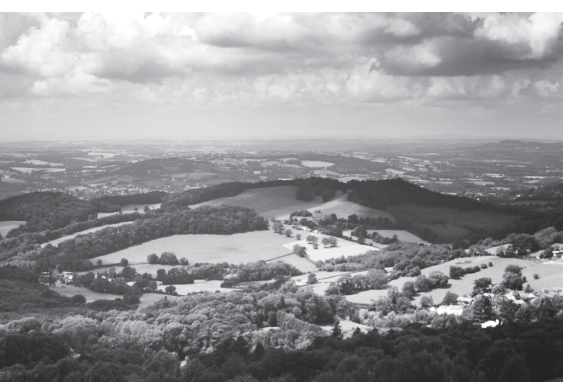
Rolling hills outside of Malvern, Worchestershire county, in the West Midlands of England.