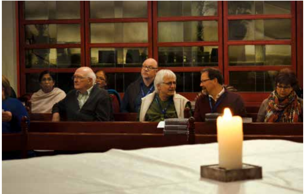
As the MWC Commissions met in Germany in February 2017, they also meditated on Scripture.

In the face of all of these perspectives, the Anabaptist ideal of a communal interpretation enjoys enormous relevance for the future. Communal interpretation understands the local church as a hermeneutic agent of the first order, and helps to relativize all human or ecclesial authority as dependent on the definitive authority of the Messiah. Communal interpretation – precisely