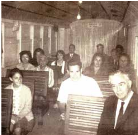
The Mennonite church in Morón, Argentina, began by meeting in an old tram. Photo taken in 1973.