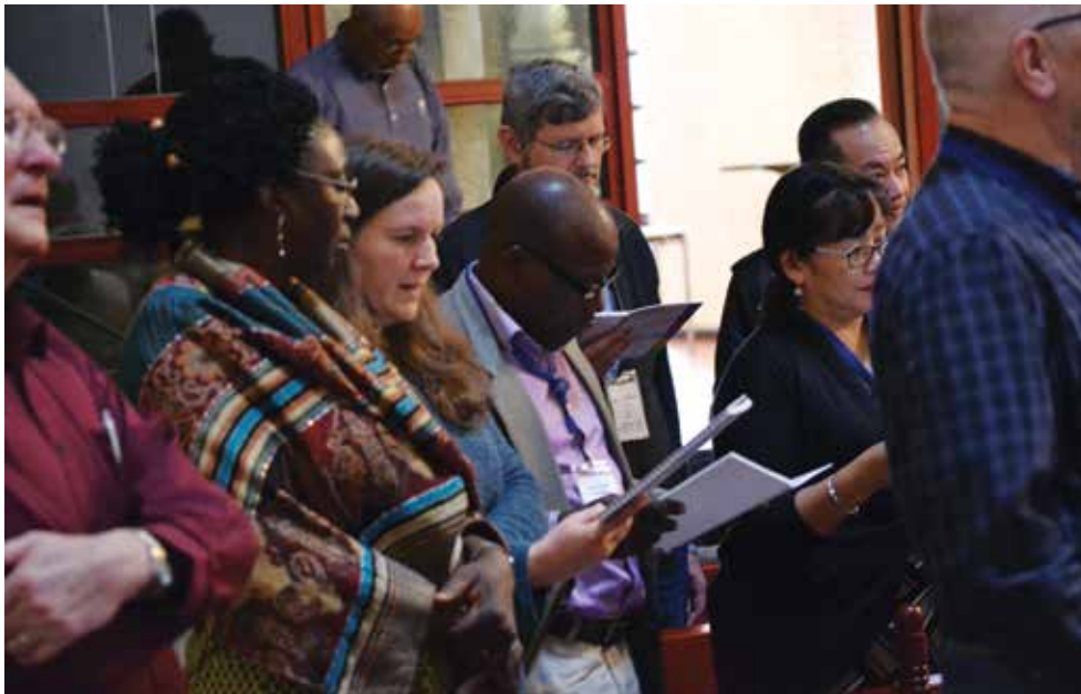
World Mennonites celebrated the transforming power of the Word at the first Renewal 2027 event in Augsburg, Germany, in February 2017.

Old enemies, church bodies that persecuted early Anabaptists, are now brothers and sisters in common endeavors such as mission enterprises, community