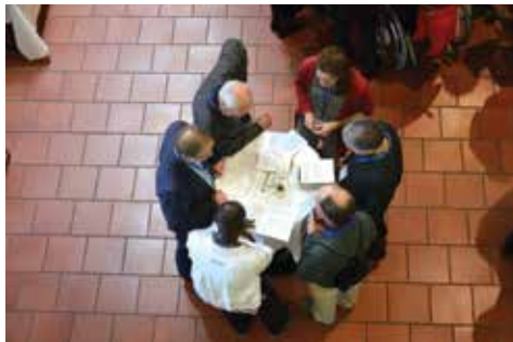
Attendees at the Renewal 2027 event studied Acts 15:1–21 in small groups. They asked about controversial understandings of church practice that are a source of tension in each other’s settings, then looked for insights from the passage.