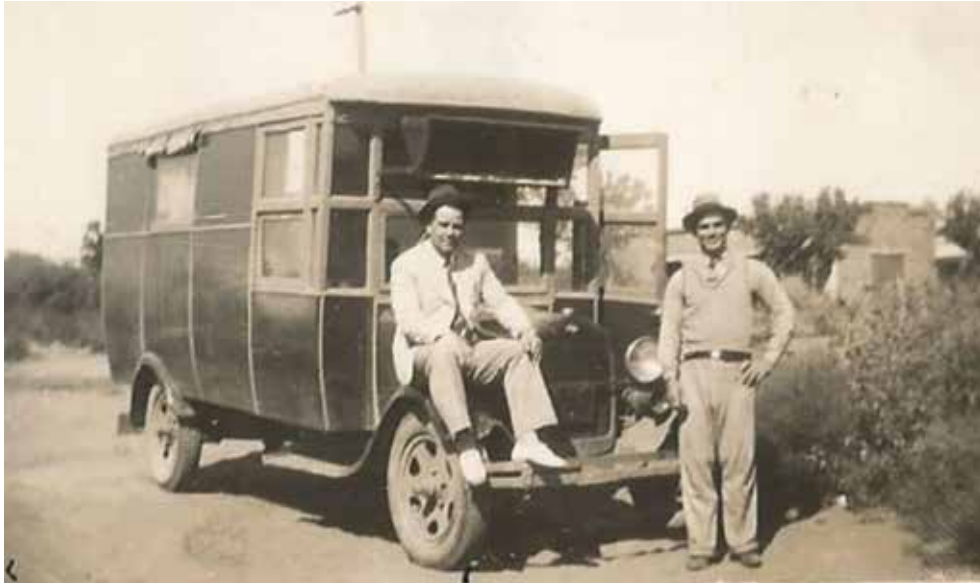
Evangelistic mission was carried out with the Bible car which provided lodging and a kitchen as workers travelled to outdoor meeting places.