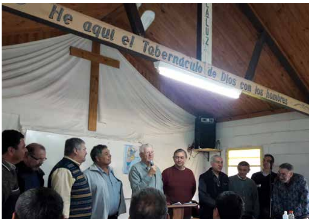
The Argentinian Mennonite pastors institute met in La Esperanza de Bragado country house 19–21 September 2017.