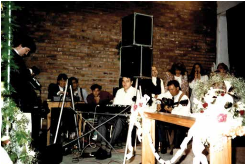
A church gathering in Morón in 1996.

Source: Global Statistics – 2015 Directory