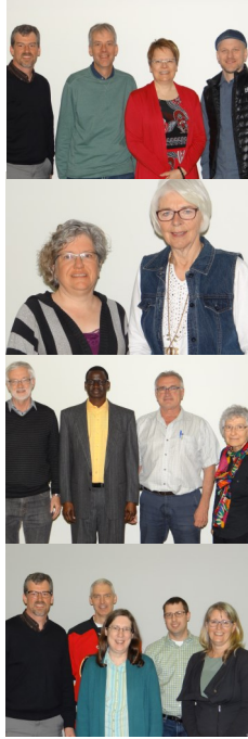
Pictured: Top to Bottom: Congregational Leadership, Community Building, Mission & Service, Executive