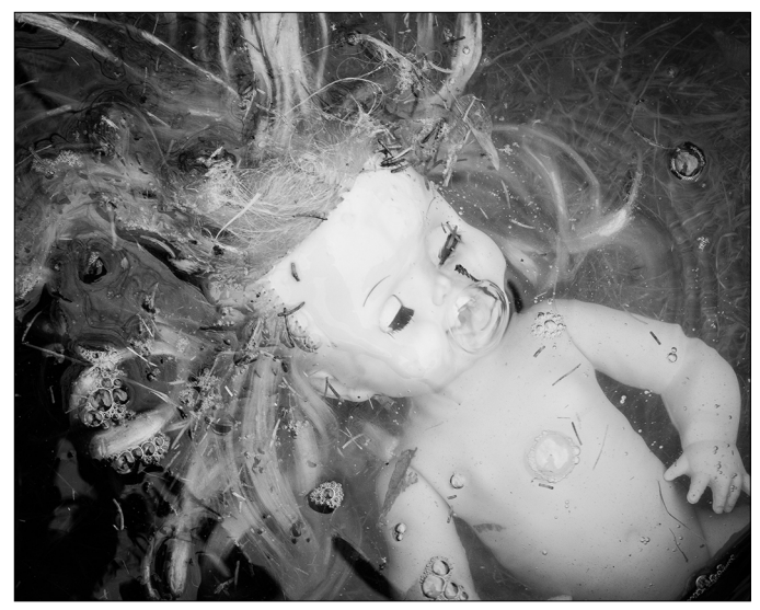
Dolls, Eveline Mangin Mauws

As a survivor of both childhood and adult domestic violence and abuse, Deborah-Zita strongly advocates for victims and survivors of domestic violence and abuse.