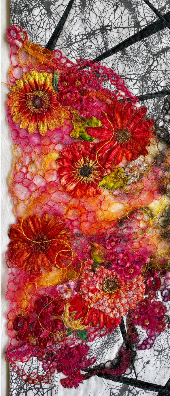
Detail of Thread of Hope , Ruth Ens (TFAM)

As summer unfolds in Manitoba, the world around us becomes resplendent with life: vivid sunsets and lapping blue waters reflecting an endless sky, layered in amongst the flora, the fauna and oh yes, of course the insects! The layers of life jostle for attention amongst the visits to the lake, epic thunderstorms, gardens and beach days that we pack into this short but sweet season.