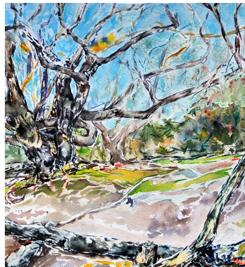
Detail of Cedar Tree Neck , John Blosser

So add some texture to your summer...bring your friends and family to enjoy these exhibitions at the Gallery.