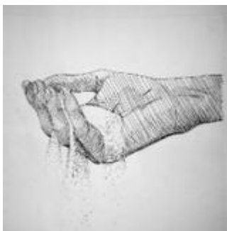
2019 Lenten Guided Prayer Experience

CommonWord has an extensive list of worship resources, devotionals, curriculum, and more that will help you fully engage with the season.