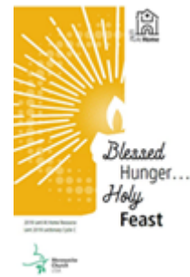
Year C, Lent 2019 At-Home Materials

Visit http://www.commonword.ca/go/1451 for all our Lent resources.