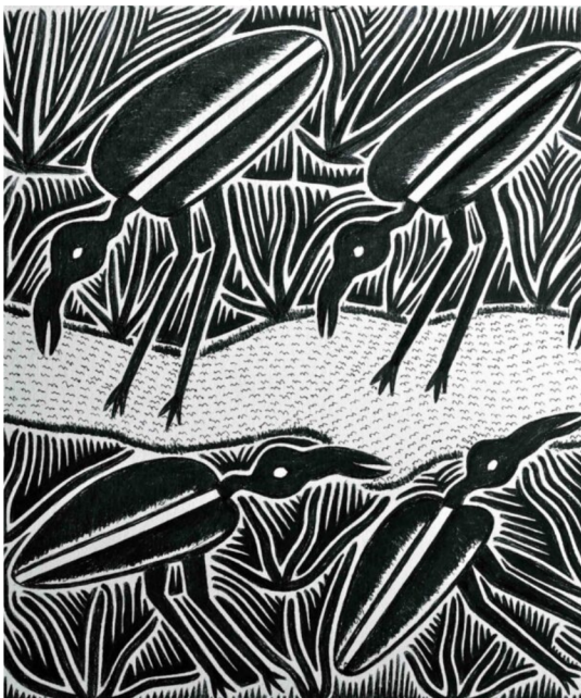
Untitled, Esteban Klassen (Artes Vivas)

Previous exhibitions at MHC Gallery have explored the cultural, political, and social landscapes that prompted many Mennonites to leave the Canadian prairies for southern locales in the early 20th century. Now, a new pair of exhibitions considers a different perspective.